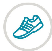
Do Healthy Things

Already a member? Log in at member.virginpulse.com